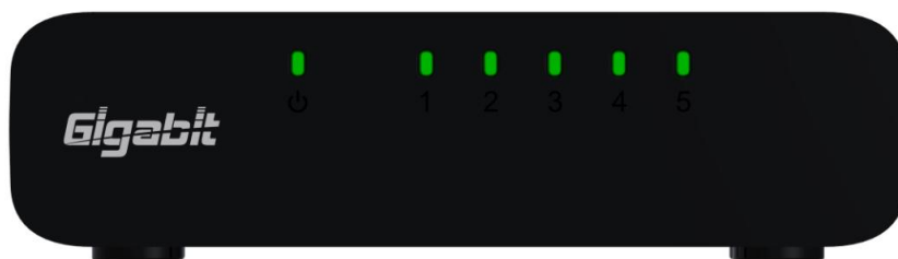
5-Port Gigabit Desktop Switch

Please refer to the following description for the front panel: